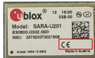
Label according to the new RED