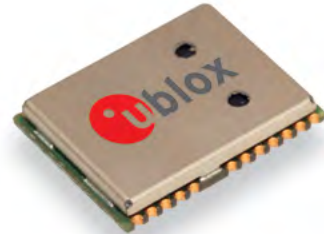
NEO-M8 series 12.2 x 16.0 x 2.4 mm