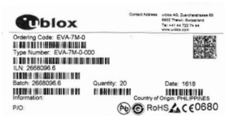
Label according to the old R&TTEd

This modification does not apply to products that are ATEX certified, which shall continue to have the notified-body ID printed on the label.